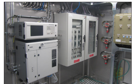
2. Internal devices