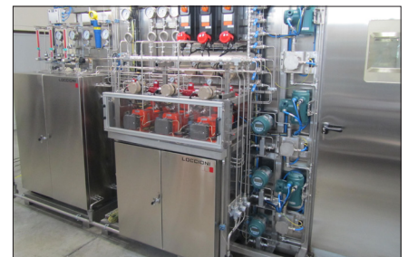
3. External devices